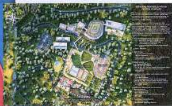
PROPOSED WORKERS REHABILITATION CENTER COMPLEX (WRCC)

With these exciting developments on the horizon, ECC is more determined than ever to continue championing the welfare of Filipino workers nationwide. The agency is committed to working harder to enhance its services and support, ensuring that the needs of workers are met with greater efficiency and care.