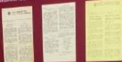
ECP INFORMATION DISSEMINATION IN THE BAY

The ECP's help in the rehabilitation facilities of hospitals located in areas where the occurrence of work-related contingencies was significantly higher in frequency. These hospitals were provided with rehabilitation equipment and materials. The rehabilitation staff of the recipient hospitals were also provided with training to ensure the appropriate operation and maintenance of the rehabilitation equipment.