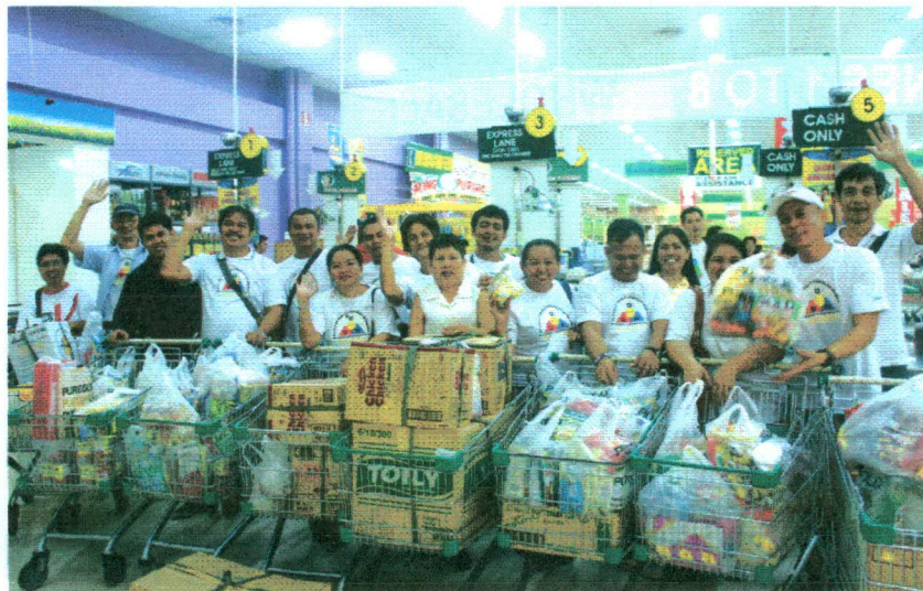
(Below) Cheering inside the supermarket after purchasing grocery items and equipments for their business venture.