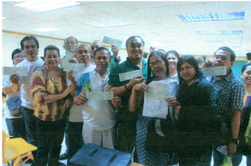
(Above) Wearing big smiles, members of ODW Credit Cooperative flash the checks they received under DOLE's Livelihood Assistance Program and;