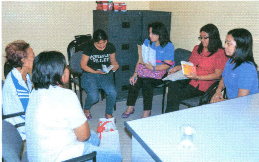
ECC-QRT members assists beneficiaries of the victims in the Serendra explosion during a QRT visit at the office of the demise employees, Staff Search Asia on June 10, 2013.