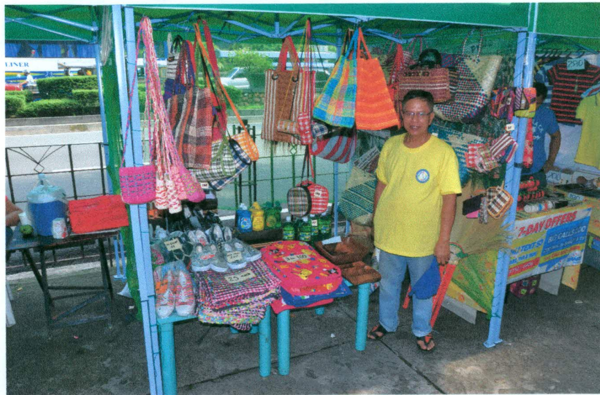
Members of Occupationally Disabled Workers Association of the Philippines, Inc. (ODWAPI) proudly show their products at the Tiangge Activity in front of the ECC building during the week-long celebration of the 35 th National Disability Prevention and Rehabilitation (NDPR) Week from July 17-23, 2013.