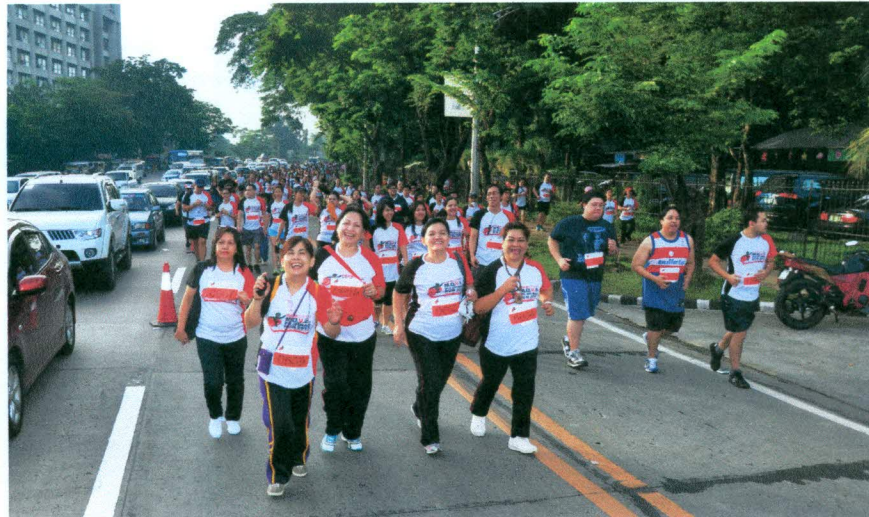
ECC staff jog in the 2-kilometer category during the PARM M.O.V.E. Pilipinas Run 2013 held at Quezon City Memorial Circle on July 21, 2013 in celebration of the 35 th National Disability Prevention and Rehabilitation (NDPR) Week.