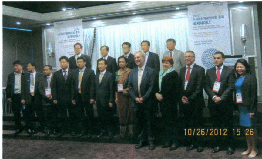
Representatives of workers' compensation organizations in Asia beam in front of photographers during the Asian Workers' Compensation Forum in Seoul, South Korea on October 26, 2012.

workers compensation organizations in Asia shall be pursued under the principle of enhanced human exchanges and information sharing among member organizations; build reciprocally favourable relationship among its members; develop and maintain reciprocally helpful relationships with other similar associations, including International Social Security Association (ISSA), ASEAN Social Security Association (ASSA), European Workers' Compensation Forum (EWCF), International Association of Industrial Accident Boards and Commissions (IAIABC), and Rehabilitation International (RI); cooperate on the development of the workers' compensation in the countries of the member organizations.