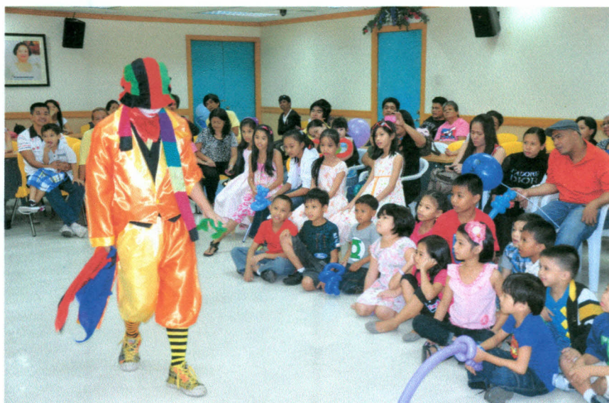
Children of Occupationally Disabled Workers (ODWs) watch the clown perform his magic tricks during the Christmas Party for ODWs and their Families held at the ECC Multi-Purpose Hall on December 19, 2012. The annual celebration of this particular party has been one of ECC's yearend activities since 2009.

The holistic approach adopted by the ECC in helping the ODWs gives life to its slogan "Higit pa sa benepisyo ang binibigay na serbisyo."