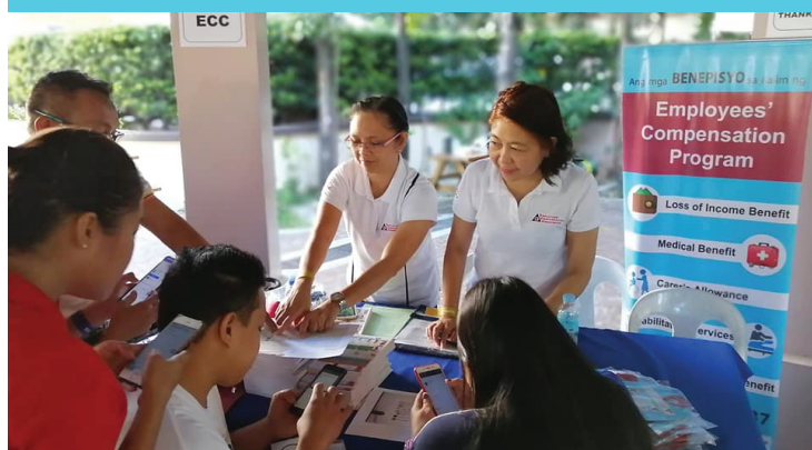
TOGETHER AGAIN. The Employees' Compensation Commission (ECC) partners with ABS-CBN in reaching the public through the ABS-CBN Kapamilya Caravan held at the People's Park in Valenzuela City on 8 December 2019.

ECC is gearing up for the next audit on November 11, 2020 to maintain the certification of the established quality management system to ISO 9001: 2015.